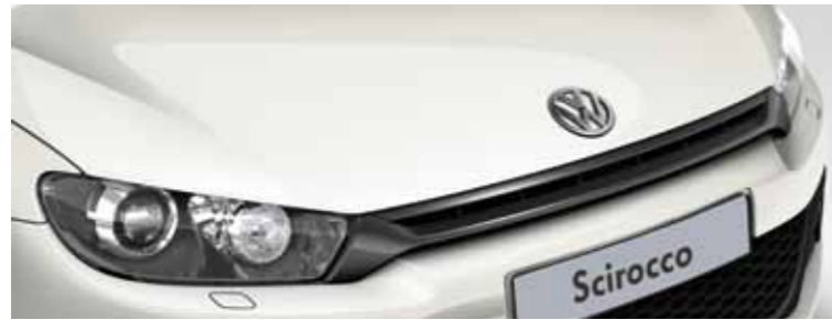
Candy White Non-Metallic B4B4