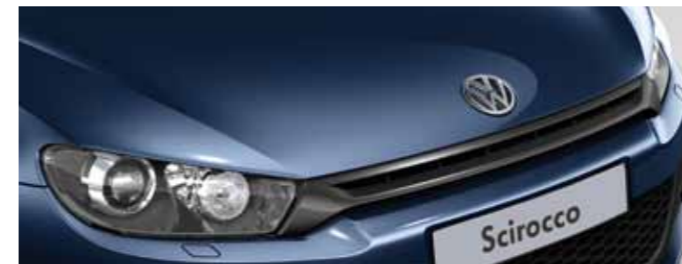
Night Blue Metallic Z2Z2

The illustrations on this page can only be regarded as a general guide as the printing process cannot render the true depth and brilliance of the paint finishes with absolute accuracy. Please note that certain paint and trim combinations may not be available.