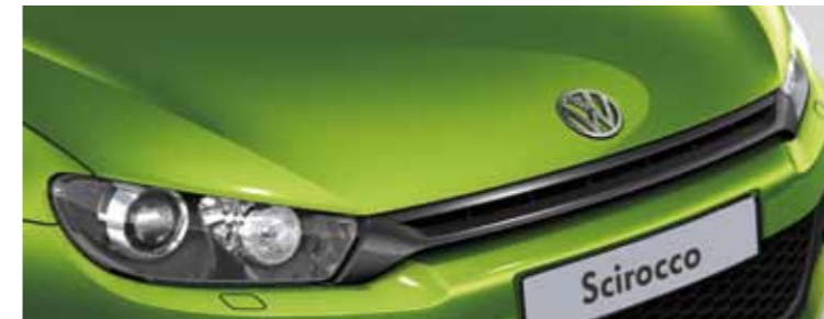
Viper Green Metallic 6B6B