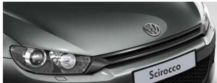
Indium Grey Metallic X3X3