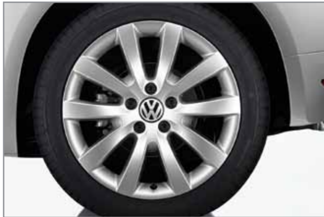
17" Long Beach alloy wheel (Standard on 1.4 TSI)