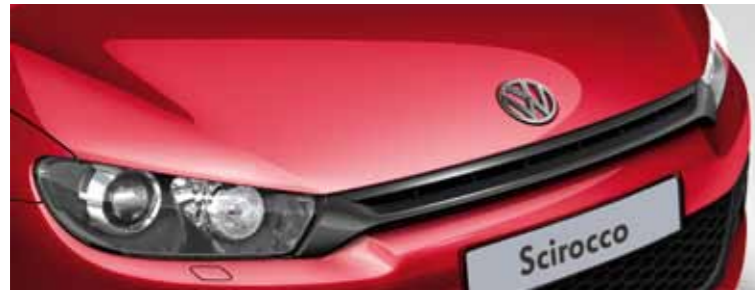
Salsa Red Non-Metallic 4Y4Y