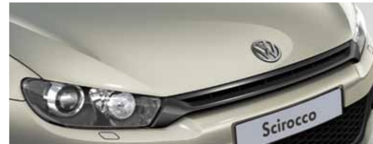
Silver Leaf Metallic 7B7B