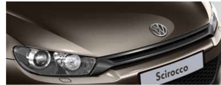
Black Oak Brown Metallic POPO