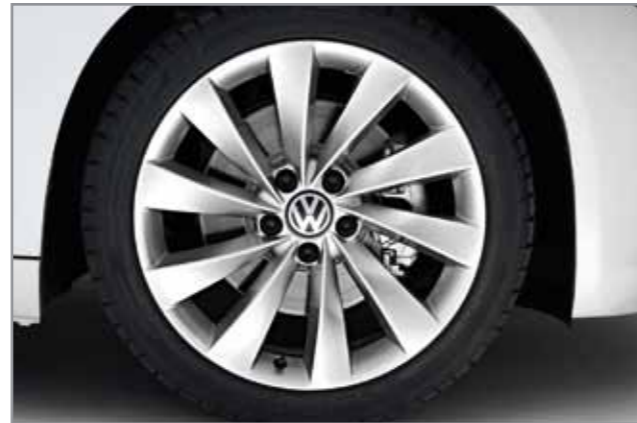
18" Interlagos alloy wheel (Standard on 2.0 TSI and optional on 1.4 TSI)