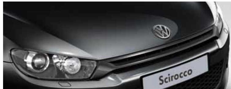
Deep Black Pearl 2T2T