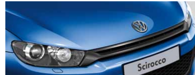
Rising Blue Metallic 4C4C