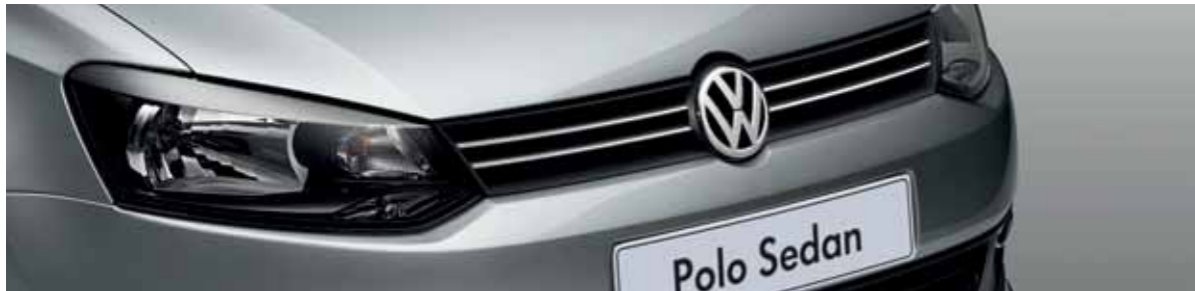
Reflex Silver Metallic 8E