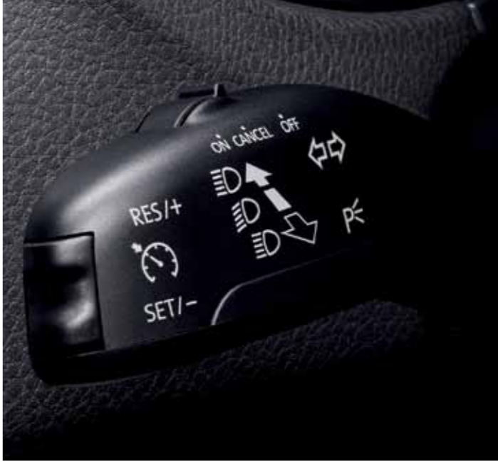
At speeds of over 30km/h, cruise control (standard on the Comfortline) keeps your selected speed constant, enabling you to relax on longer journeys, without having to keep an eye on your speedometer.