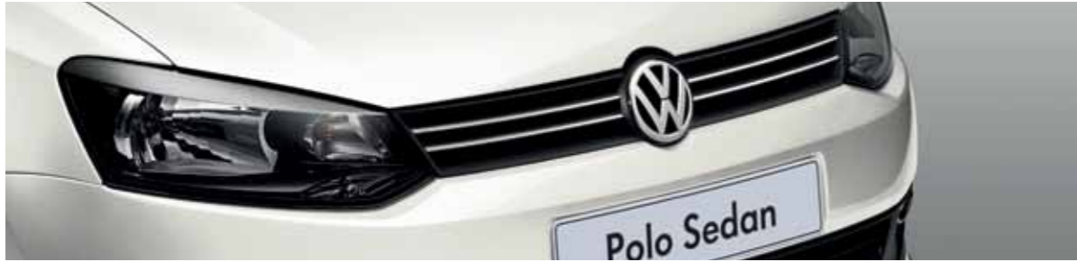
Candy White Non Metallic B4