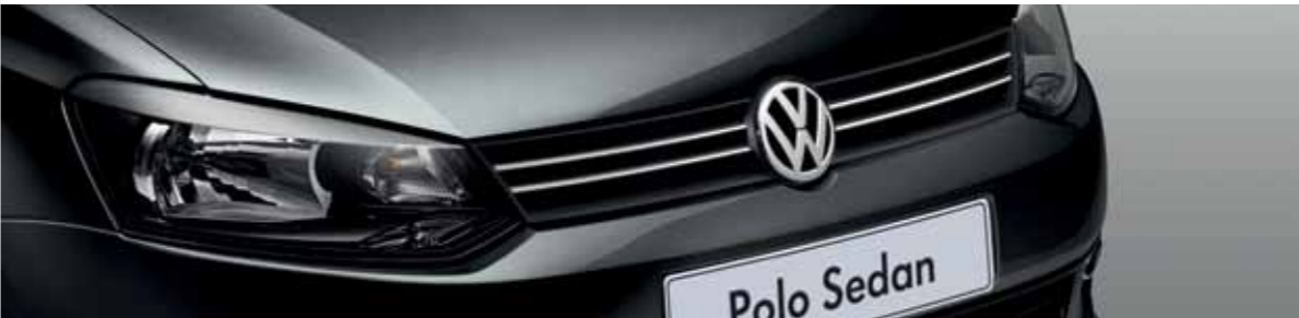
Deep Black Pearl Effect 2T