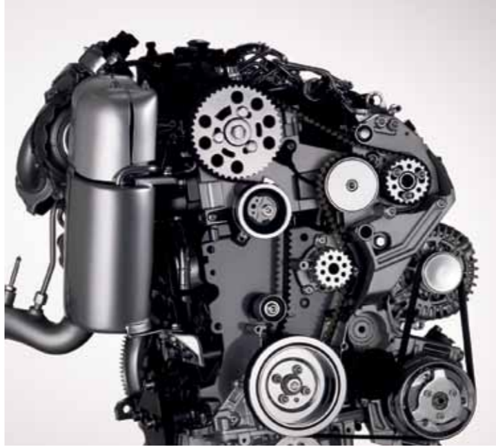
The new generation 16-valve petrol engines are available in 1.4 and 1.6 derivatives. These multi-valve petrol engines offer improved torque delivery, reducing fuel consumption and CO 2 emissions.