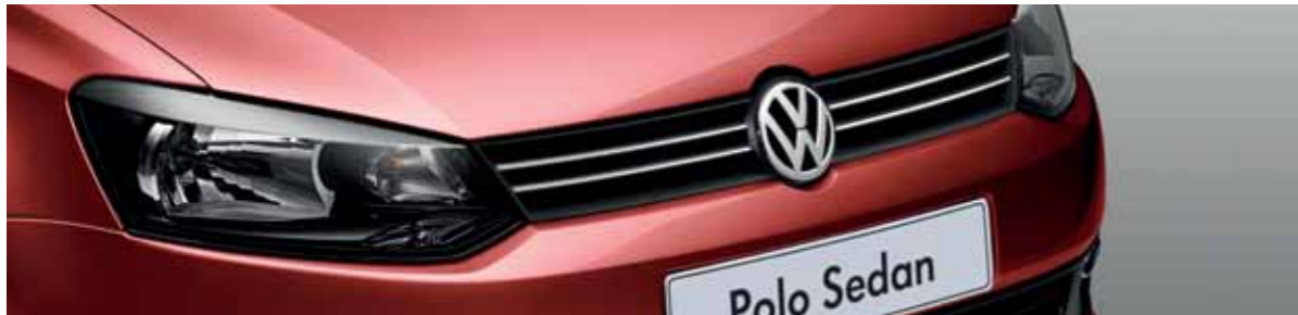
Flash Red Non Metallic D8