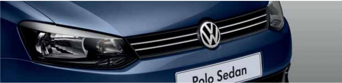
Shadow Blue Metallic P6