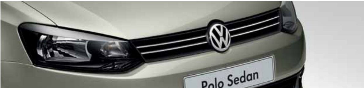
Terra Beige Metallic 4G