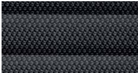
Titan Black 'Livon' cloth Standard on the Comfortline.