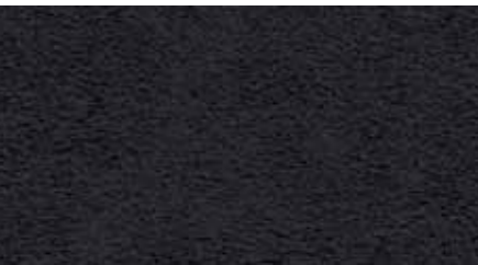
Alcantara 'Vienna' leather combination Optional on Comfortline only.