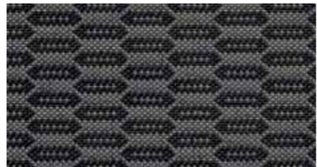
Titan Black 'Metric' cloth Standard on the Trendline.