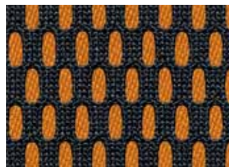
Magma Orange 'Dimension Corn Poppy'