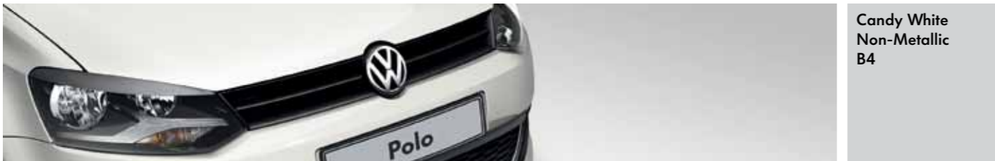
Candy White Non-Metallic B4