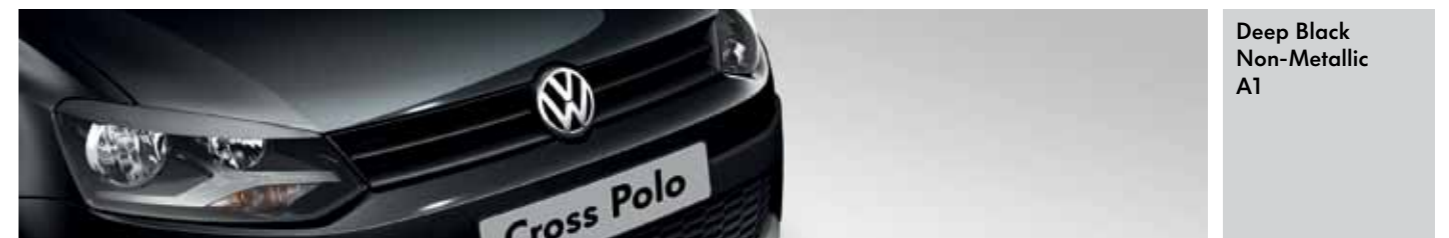
Deep Black Non-Metallic A1