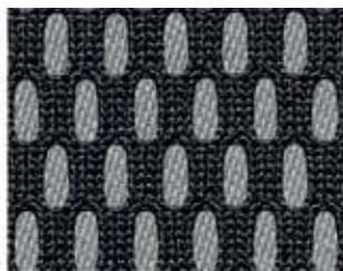
Grey 'Dimension Corn Poppy'