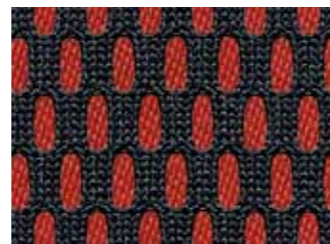
Hot Orange 'Dimension Corn Poppy'

Expect big adventures in the Cross Polo. With off-road features like 15mm raised suspension, rugged all-terrain looks, and tough moulded guards for protection, you'll be ready for any urban challenge. Foldable rear seats increase cargo capacity from 280 to 952 litres, and the stylish silver roof rails allow for