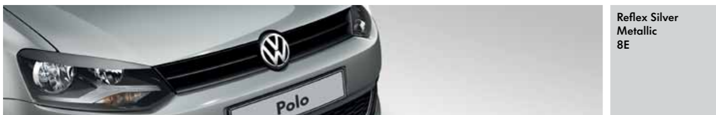
Reflex Silver Metallic 8E