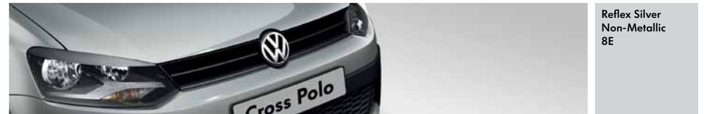
Reflex Silver Non-Metallic 8E