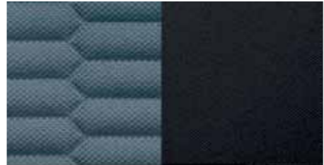
Titan Black 'Power On' cloth Standard on the Polo BlueMotion only.