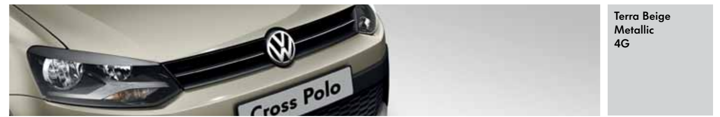
Terra Beige Metallic 4G