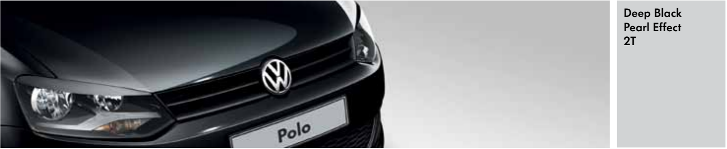
Deep Black Pearl Effect 2T