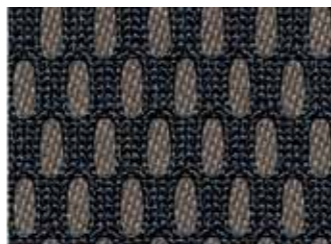
Latte Macchiato 'Dimension Corn Poppy'