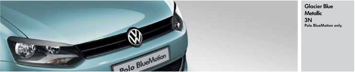
Glacier Blue Metallic 3N Polo BlueMotion only.