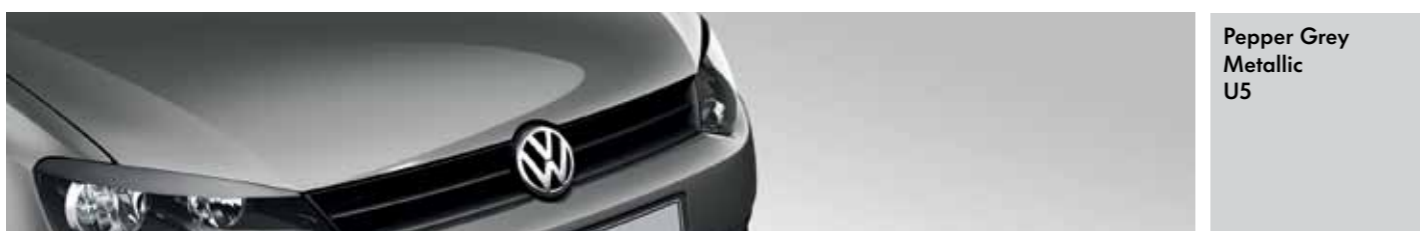
Pepper Grey Metallic U5