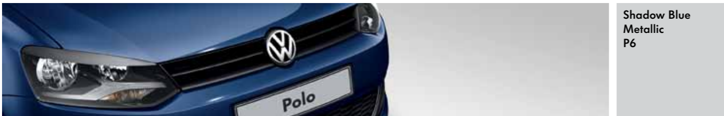
Shadow Blue Metallic P6