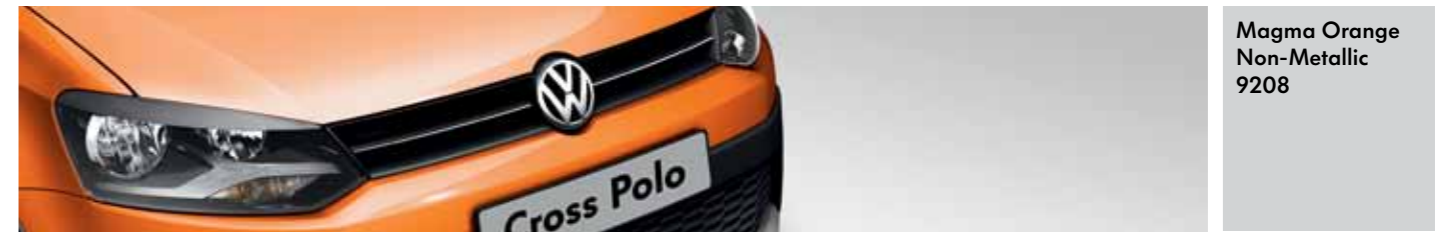
Magma Orange Non-Metallic 9208