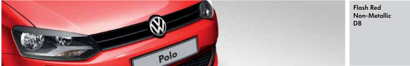
Flash Red Non-Metallic D8