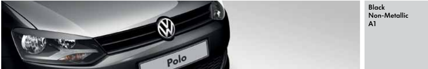
Black Non-Metallic A1