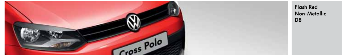
Flash Red Non-Metallic D8