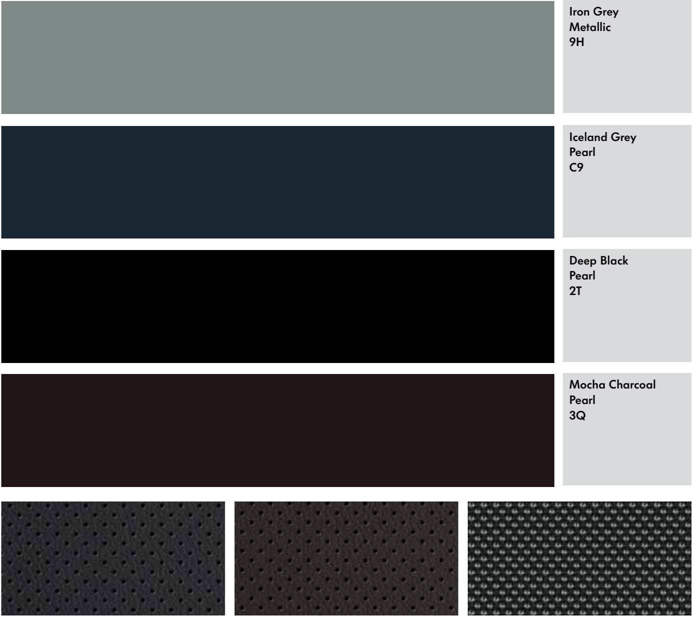
Vienna Climatic Leather* Seats Black - QQ