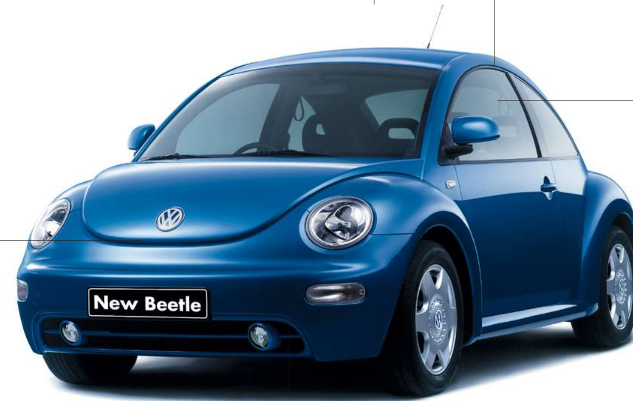
Safety First, Last and In-between

The view inside New Beetle is just as spectacular. It's both classic and cutting edge. Start with the swept back dashboard area, which disappears over your driving horizon toward the tinted windscreen. A single large round dial displays speed, revs, temperature and fuel gauge, illuminated at night by a soft indigo-blue glow. Splashes of aluminium and slate adorn the interior, steering wheel, gear shift, and handbrake. Then there's the playful extra - a vase waiting for the flower of your choice. Throughout the cabin, controls are illuminated in red. Comfort in New Beetle is in the premium car class. There's loads of head and legroom. Seats are body hugging and infinitely adjustable. While air conditioning, electronic window and mirror controls, an adjustable steering wheel and a stereo sound system are just some of the many luxury